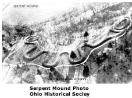
Serpent Mound

Coincidentally Serpent Mound is near the center of a unique geological structure that was created when a cataclysmic explosion occurred sometime after the Mississippian Period ended, 325 million years ago. Scientists believe a meteor struck the area. The force of the explosion must have been immense. Immediately after impact, the center rebounded, lifting Ordovician rocks 950 feet above their normal positions. In contrast, an outer ring of younger Mississippian sandstone and shale was depressed nearly 400 feet. As these sandstones are harder than the surrounding rocks, erosion has resulted in a circle of hills clearly visible from