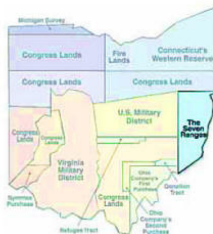
The Seven Ranges